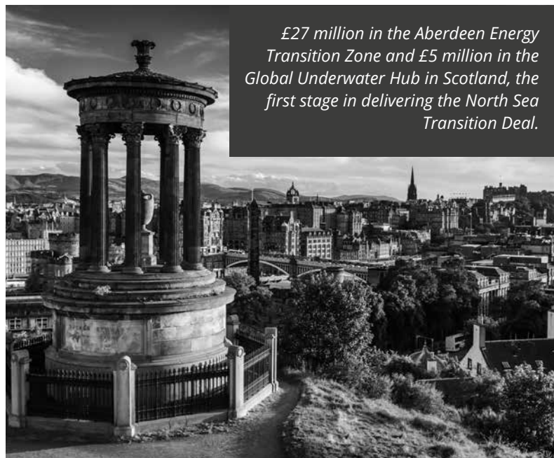
£27 million in the Aberdeen Energy Transition Zone and £5 million in the Global Underwater Hub in Scotland, the first stage in delivering the North Sea Transition Deal.

Where spending decisions apply to Great Britain, the Northern Ireland Executive will be funded to replicate the arrangements in Northern Ireland. ◀